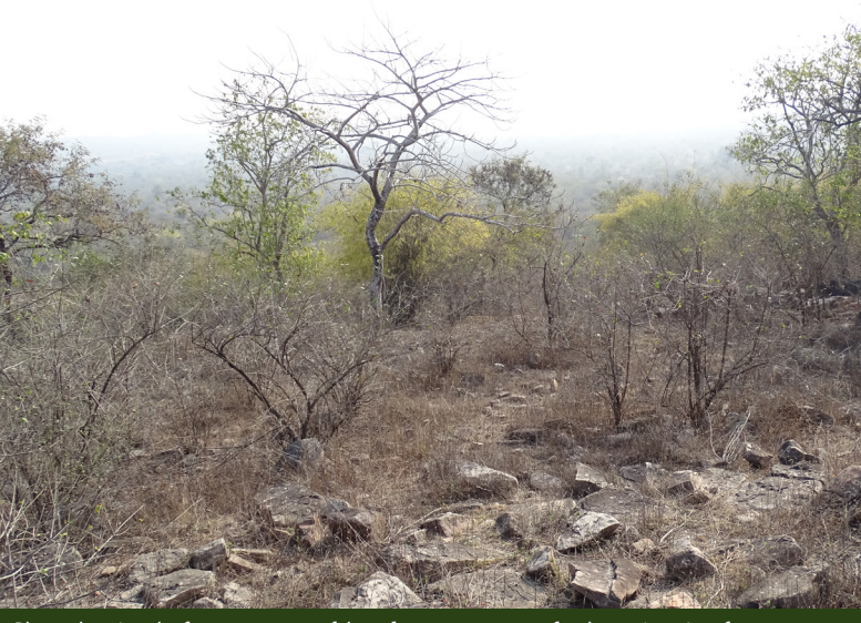
Photo showing the forest structure of the reference ecosystem for the project site of course participant Debadityo Sinha, who focused his term paper on forest restoration for dry tropical forest in Marihan Forest Range, District-Mirzapur, India.