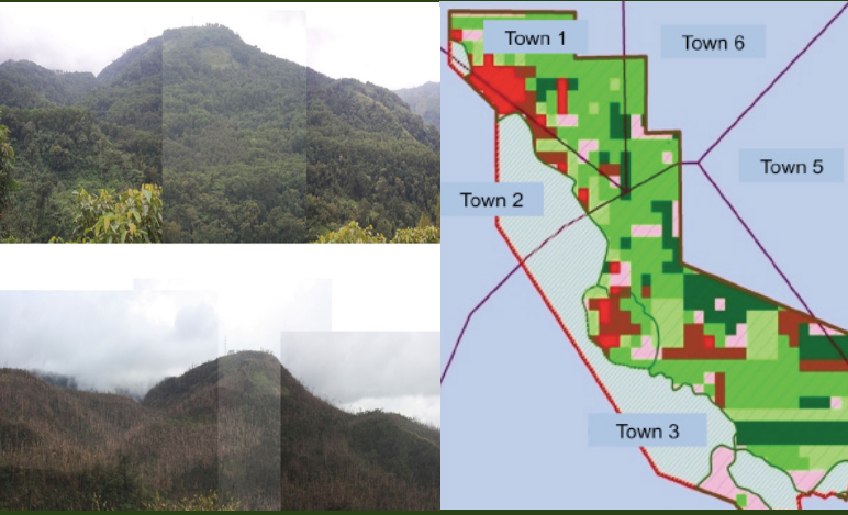
Images and maps provided for a hypothetical project site, adapted from a real-life project of an ELTI course alumnus. The hypothetical project site offered the opportunity for participants without thier own project site to apply their learning from the weekly materials, and go through the steps of developing a restoration plan.