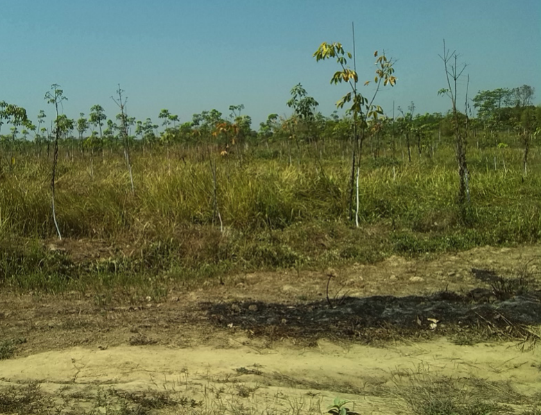
Rubber plantation where course participant Myat Ko Ko Oo focused his term paper on forest restoration in the Magri Forest Reserve of the Bago Mountain Range of central Myanmar.