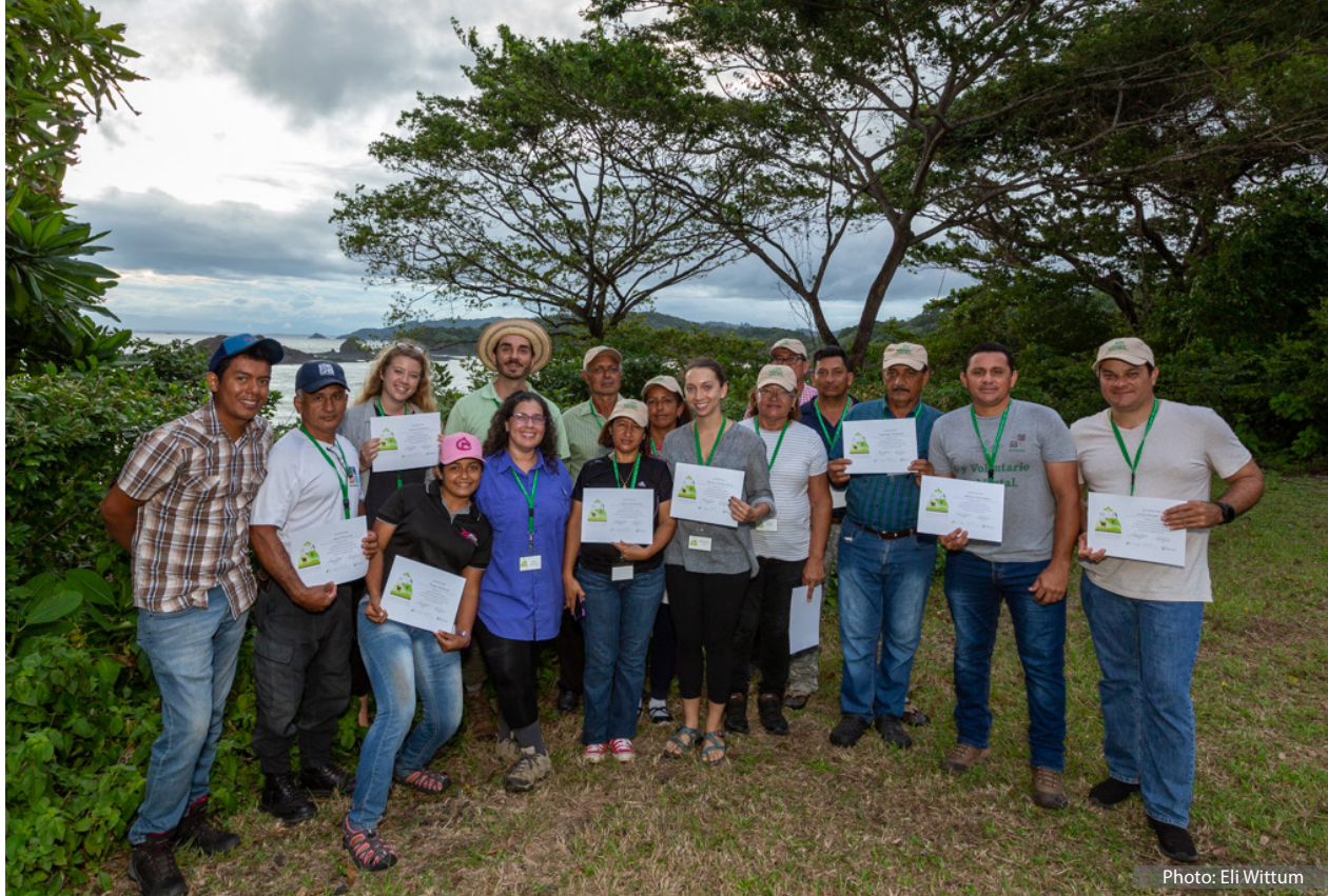
A final group photo of the participants with their certificates.