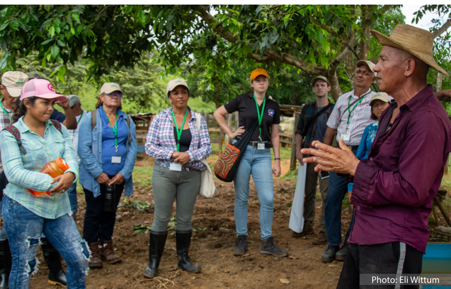
Participants learn about the experience of an APASPE member transforming his farm from conventional to more ecological practices.