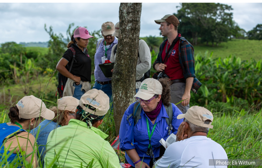
A group of participants discuss their rapid assessment of a farm and develop restoration strategies to present to the farm owner.