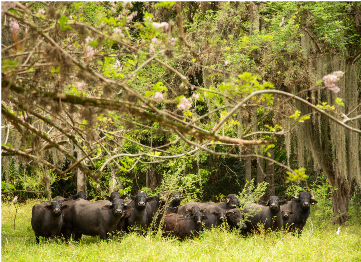
Water buffalo in a silvopastoral system at El Hatico Nature Reserve, Colombia.

Background: During the last five centuries, conventional cattle ranching has transformed ecosystems throughout Latin America, with negative impacts on biodiversity, forests and climate stability. However, the ecological processes that sustain productivity can be enhanced by integrating trees and shrubs into grazing systems, which helps address the conflict between livestock and the environment. Silvopastoral systems use water, soil and local biodiversity efficiently to produce high-quality food. At the same time, they conserve forests and other natural ecosystems, facilitate the ecological restoration of degraded land, enhance rural people's quality of life, promote animal welfare and generate ecosystem services.