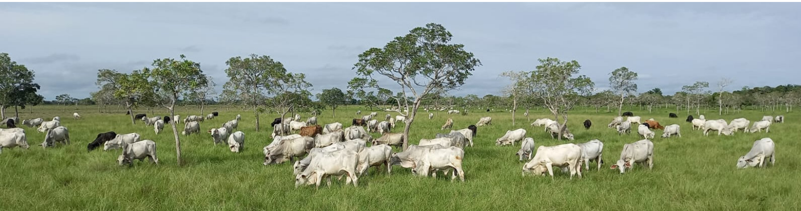
Course participant Víctor Argüello works to implement silvopastoral practices in the Beni floodplains of Bolivia, a mosaic of natural grasslands, seasonal wetlands and subtropical forests.

The first module introduced agroecology and sustainable livestock production. The following three modules focused on the technical aspects and planning of silvopastoral systems. The final module explored the cultural change that must take place to mainstream tree-based livestock production in Latin America.