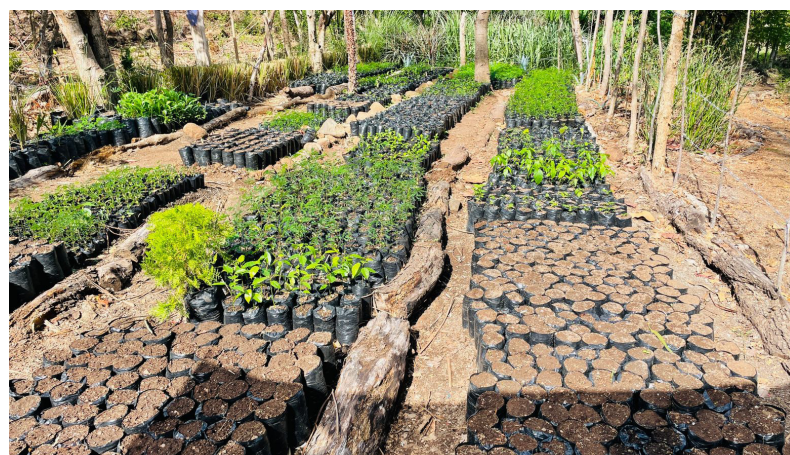
Tree nursery for the implementation of silvopastoral systems. Course participant Faran Dometz and his colleagues from Sustainable Vets International are working to rehabilitate degraded land in the island of Ometepe, Nicaragua.

Module 5. Cultural change toward sustainable ranching