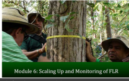
View of online course platform, which is comprised of six thematic modules

This online course was designed to provide a solid foundation on FLR and develop capacity of FLR practitioners on how they can identify, analyze, and prioritize FLR opportunities using the Restoration Opportunities Assessment Methodology (ROAM). The course provided participants with a series of presentations, live discussion sessions, and activities designed to help them to develop a restoration plan, to apply what they learned during the course, and to discuss strategies to unlock finance and scale up FLR. The course was offered to practitioners and professionals directly involved in FLR, such as IUCN partners and members (including government). Participants exchanged experiences with other peers, and shared concepts and tools with each other, the ELTI facilitators, and guest experts.