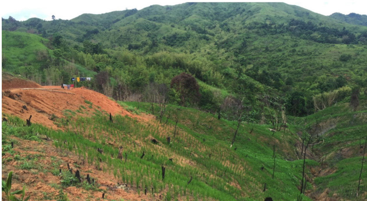
Slash and Burn Cultivation in the Upper Marikina River Basin Protected Landscape, Philippines, which was part of the focal region for participant Maurice Rawlin's final project.

The Restoration Opportunities Assessment Methodology (ROAM) provides a framework for countries and regions to identify, analyze, and prioritize restoration opportunities in order to develop a suite of restoration strategies for particular contexts. By situating ROAM within a broader framework of academic knowledge on tropical forest and landscape ecology, socio-political and economic processes related to restoration, and restoration strategies, individuals involved with FLR policy, planning, and implementation can develop the foundation needed to achieve a range of objectives, such as economic growth, food security, biodiversity conservation, and carbon sequestration.